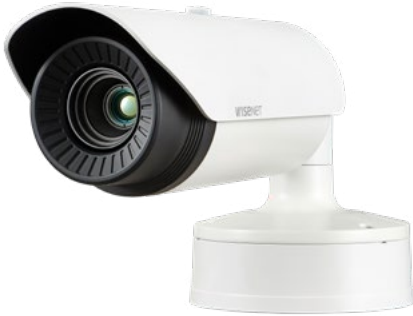
TNO-4030TR / TNO-4040TR